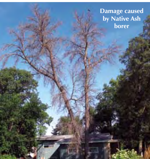
Damage caused by Native Ash borer

The Western Nursery Growers' Group (WNGG), the only organization representing nursery growers (retail and wholesale) across all four western provinces, decided to accept the challenge of identifying new tree cultivars/selections by setting up an eight year tree trial at four locations on the prairies. The WNGG tree committee designed the Prairie TRUST project to test approximately 150 cultivars/selections that are either new to the region or previously not in widespread cultivation, but have shown anecdotal evidence for hardiness in these climate zones. In 2008 I was hired by WNGG to be the project manager. The project received financial assistance from a wide spectrum of government and