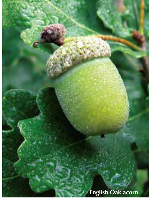
English Oak acorn

Trends do change in rare tree collecting as they do in other types of collecting. Trees such as Black Walnut, English Oak, Norway Maples (Crimson King, Deborah), Freeman Maples, Sugar Maple and Honeylocust that were considered rare on the