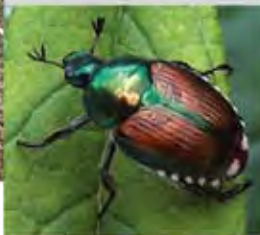
(clockwise from left) Emerald Ash Borer, Asian Long Horned Beetle, Banded Bark Elm Beetle and Japanese Beetle